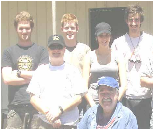
Happy participants relax after the Trevor Watson trophy shoot

All of the Association members and families had 12 shoots, commencing at 11.00 am. We were finished around 1.00pm.